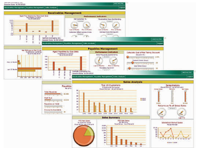
Accounts Payable, Receivable, and Sales Analysis dashboards